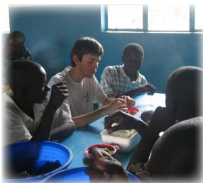
PROJECT RESPOND. (left) Eating lunch together in the cafeteria. (right) Student tutoring after school. (bottom rt.) Teaching a song in the elementary school. Click on picture to view video on YouTube.