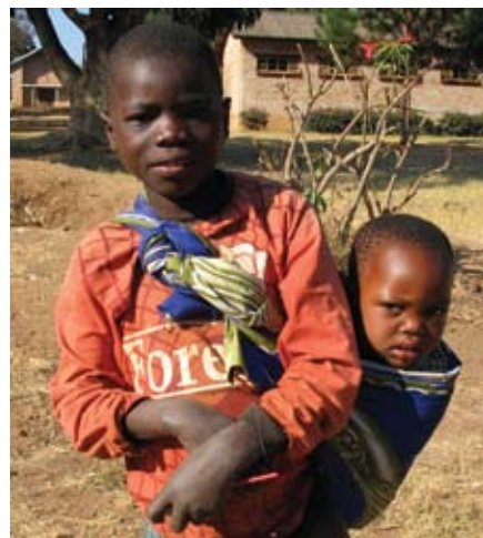
CHILDREN. The children of teachers at St. Francis High School in Malole, Zambia

Click here to fill out our contact form for more information about our community