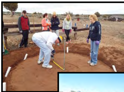
← Bishop Guertin faculty and students lay out the Mission's new sweat lodge. ↓ Saint Louis University students work to repair erosion on a reservation road near the Mission.