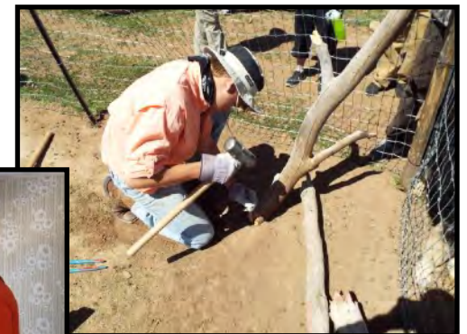
↑ A Saint Stanislaus student repairs the fence in a sheep corral. ← Young men discerning their vocation assist with renovations at the Mission.