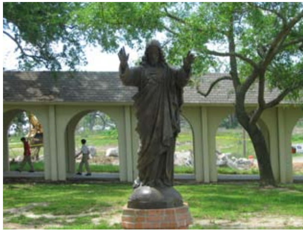
STATUE. The statue of the Sacred Heart behind St. Stanislaus High School (Bay St. Louis, MS). The statue that survived Katrina!

He is our reference point and the center of our motivations, just as he is the very principle of our total self-offering and of our apostolic action.